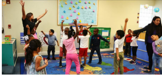
ABC's of a Healthy Me Session 1 - Overview

Complete all six sessions to earn 1 Continuing Education (CE) Credit!