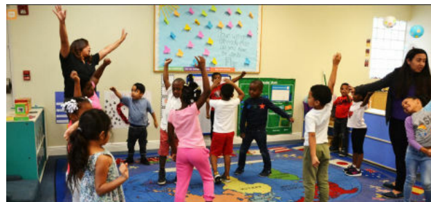
ABC's of a Healthy Me Session 1 - Overview

Complete all six sessions to earn 1 Continuing Education (CE) Credit!